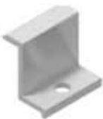
End Clamp (35mm) LM-EC35-BARE