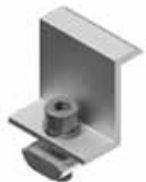
End Clamp (30mm) LM-EC30-RNW