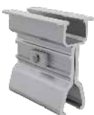
Roof Clamp LMK-KS-700L (Tumbled)