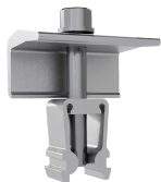
End Clamp (30-40mm) LM-DEC30-40