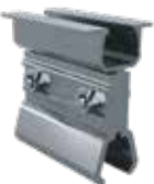
Roof Clamp LM-KS-700 (Anodised)