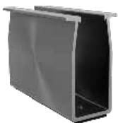
Roof Clamp LM-SRL65-M6-E