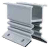
Roof Clamp LM-CRL